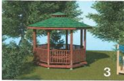
COMMONS GREEN SPACE